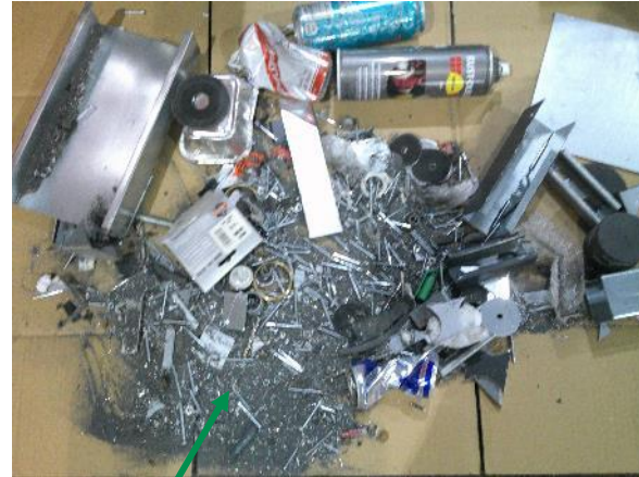
Cans, Aluminium and metals