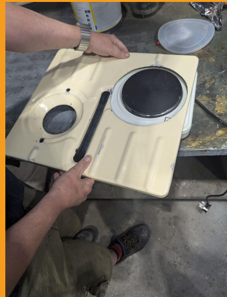
Repurposing an old hob to make it work safely.