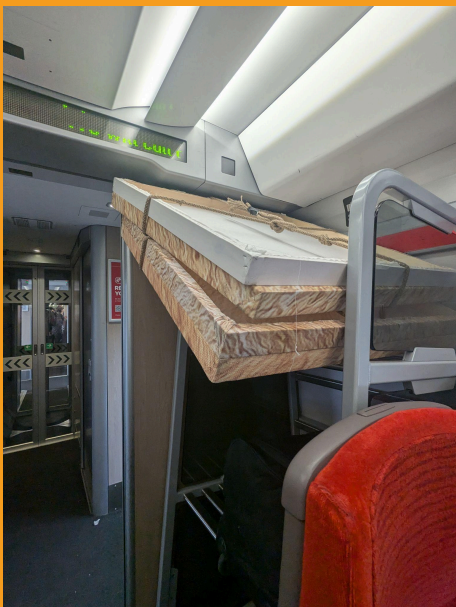
Using trains to move samples around

For transport on the production, 1 truck and 1 van were moved for every move, with the expectation of the final get-out when just 1 truck was used. The aim originally was to just have the 1 truck for the moves as well, but unfortunately it became evident the additional van was needed to avoid damaging the flats. However, 1 less truck than usual was needed due to the set being built onsite in Leeds. That being said, the success of the sound-hand sourcing, using Leeds-based prop and costume stores, and rehearsals in London and Leeds did mean many more vans were used during the rehearsal and pre-production process.