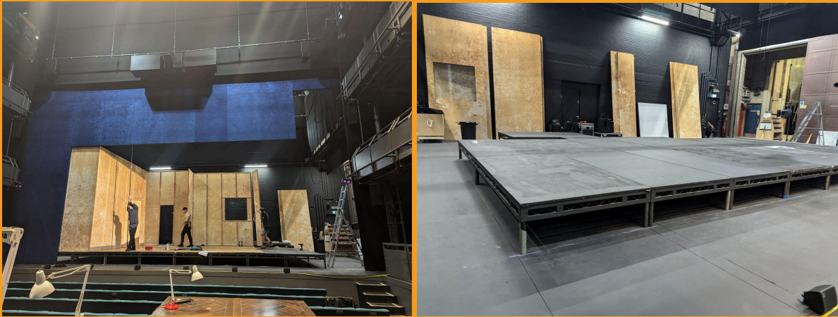
Images of the fit-up

For transport on the production, 1 truck and 1 van were moved for every move, with the expectation of the final get-out when just 1 truck was used. The aim originally was to just have the 1 truck for the moves as well, but unfortunately it became evident the additional van was needed to avoid damaging the flats. However, 1 less truck than usual was needed due to the set being built onsite in Leeds. That being said, the success of the sound-hand sourcing, using Leeds-based prop and costume stores, and rehearsals in London and Leeds did mean many more vans were used during the rehearsal and pre-production process.