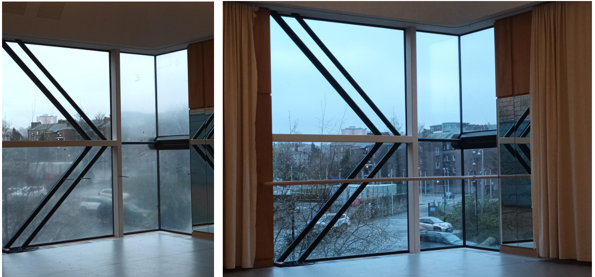
Polycarbonate being added and the final result

As a part of the project destratification fans were also installed into the dance studio, which help by pushing rising heat down to the working level. It used to take four to five hours to get the room up to temperature, whereas now it only takes one. So far in the month of May 2024 Dundee Rep have saved 5,500kwh of energy (compared to previous figures).