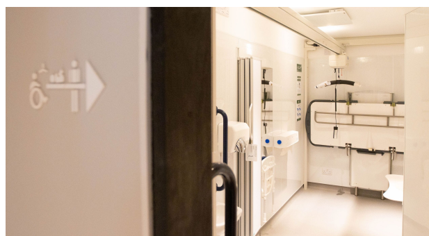
New toilet and Changing Places Toilet